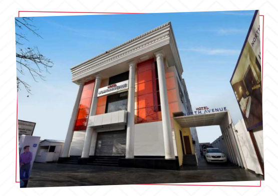
Five Elements Hotels Kamla Nagar