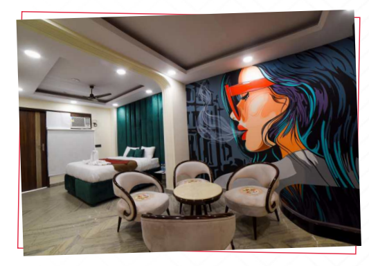
The Twenties Hotel Kamla Nagar