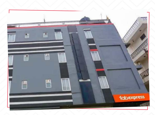
FabHotel PP Residency Gujranwala Town