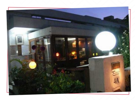
Petite Homestays Civil Lines

Explore More: https://shorturl.at/inMP3 @